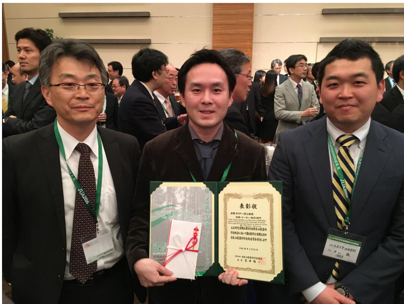
Prostate Cancer-Associated Aberrant Glycosylated S2,3PSA test utilizing microcapillary electrophoresis-based immunoassay enabled clinical application for early diagnosis of prostate cancer