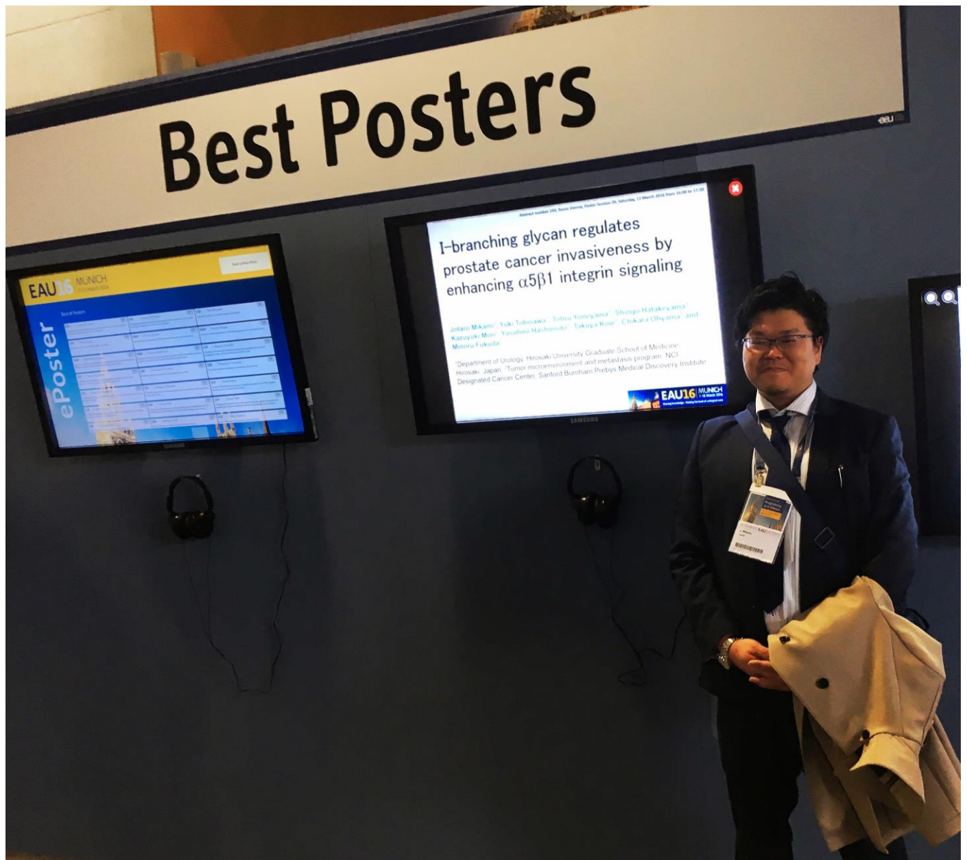
I-branching glycan regulates prostate cancer invasiveness by enhancing \alpha5\beta1 integrin signaling